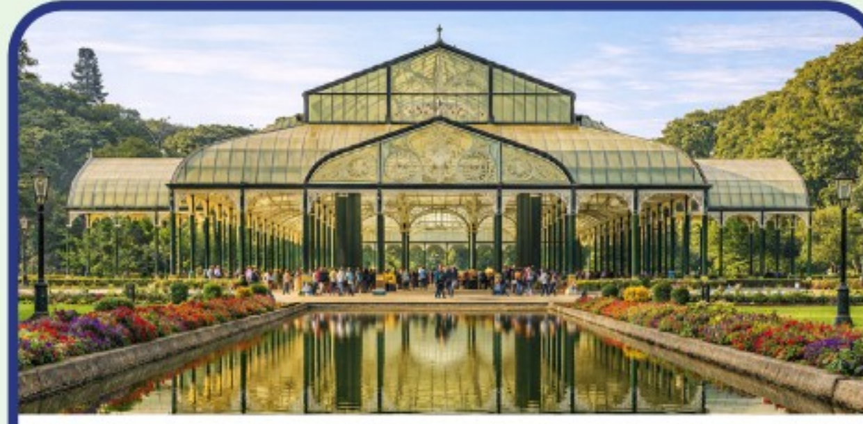
LAL BAGH GARDEN